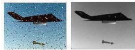
Figure 4: Noise Removal

identification and extraction in image. Extracted text images will be compared to dictionary database to predict the text equivalent of its image.