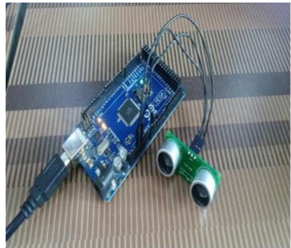
Figure 2: Proximity Sensor

can have a high reliability and long functional life because of the absence of mechanical parts and lack of physical contact between sensor and the sensed object. Proximity sensor has transmitter and receiver in which transmitter sends ultrasonic waves and the receiver will receive the reflected waves to detect the obstacle.