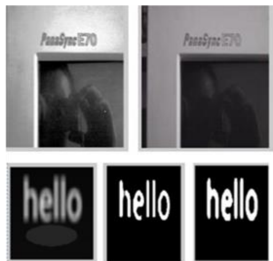
Figure 5: De-Blurring

Enhanced Pre-processed image from previous block is forwarded to Processing stage where text detection and extraction is done. Before processing, it is binarized with adaptive thresholding. As a result of literature survey, we used combination of connected component (CC) & region based approach on this Binarized (black and white) image. Applying CC analysis using MATLAB software, areas having text similar patterns with white pixels on dark background, are detected. Using feature extraction algorithm, these detected areas are extracted on separate windows. Figure 6 shows text detection and extraction from Scene as well as Document image. Scene image requires preprocessing whereas Binarized Document image is directly fed to Text detection block. From Figure 4, it is observed that false detections are present due to some amount of noise in scene image including the Real text of image. This false detection reduces accuracy of the system. It also increases processing time and hence, decreases speed of the algorithm.