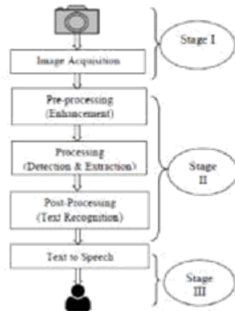
Figure 3: Process of Object Recognition

A shop banner image is captured and image Preprocessing (background removal, noise filtering) are done. The preprocessed image is then subjected to text